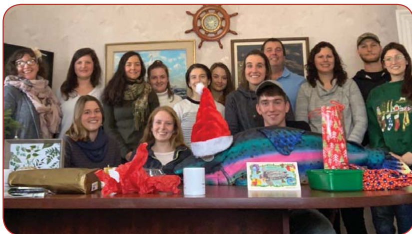
Coastal Action 2018 staff during our Secret Santa party on December 14.

Holiday Donations as Charitable Gift Giving Page 3