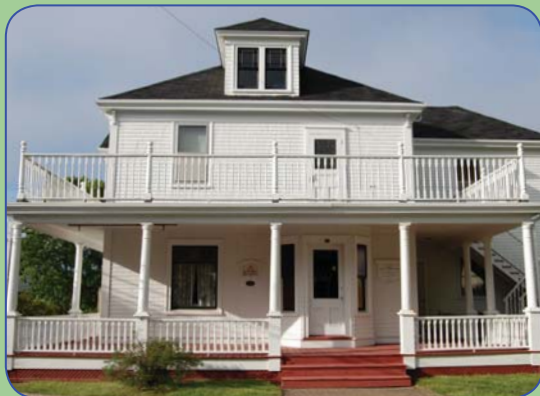
Our home at 37 Tannery Road in Lunenburg.

Looking for the holiday gift that keeps on giving for generations to come? Coastal Action is celebrating 25 years of environmental community work throughout 2019! Your donations support the Coastal Action vision: a healthy environment for future generations. This is achieved through our mission: to restore and protect the environment through research, education, and action.