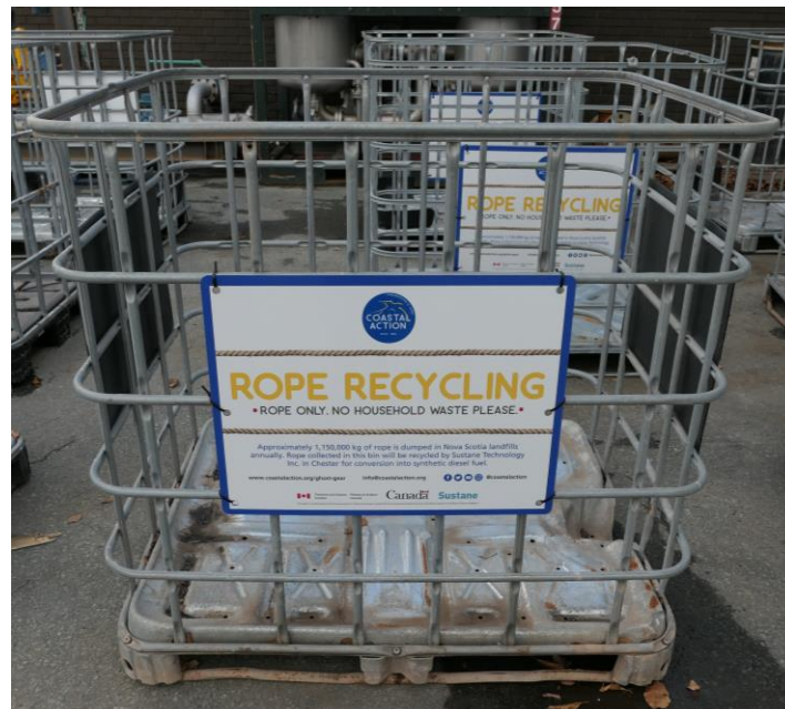
Figure 1: Coastal Action rope recycling bin. Bins are repurposed intermediate bulk containers donated by Terrapure.

As part of Coastal Action's Ghost Gear Project , 10 rope recycling bins (Figure 1) have been installed at 9 wharves in Southwest Nova Scotia (Figure 2) as a pilot program to divert rope from moderate to high-impact disposal methods, such as landfilling, burning and illegal dumping. Clean polypropylene rope is suitable for recycling, and therefore collected rope can be recycled at Sustane Technologies Inc. , in Chester, NS, for conversion into synthetic diesel.