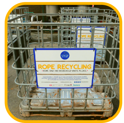
Rope recycling bin

Collected rope will be recycled* into synthetic diesel at Sustane Technologies , in Chester, NS