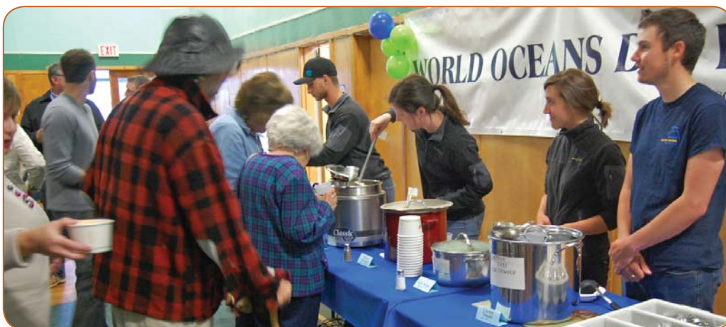
Lining up for a fine selection of local chowder in 2016 - with lots for everyone!

Who will be serving chowder this year? We may have a few local celebrities up our sleeve; you must drop in and see! For tickets call (902) 634-9977 or email bernice@coastalaction.org