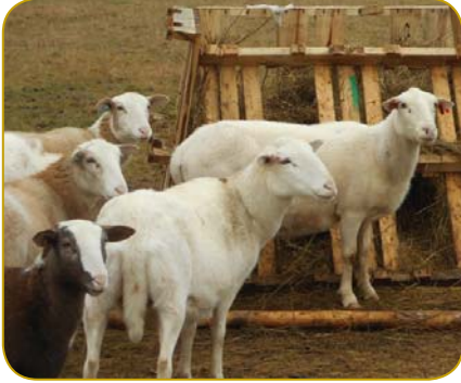
Residents of a local farm seem interested in their environment, as well.

Are you a farmer looking to improve the relationship between your property and the environment? Coastal Action is seeking Lunenburg County farmers interested in making their farms more sustainable. Our past collaborations with local farmers include livestock fencing, providing alternative watering sources, riparian planting, and Agricultural Biodiversity Conservation Plans