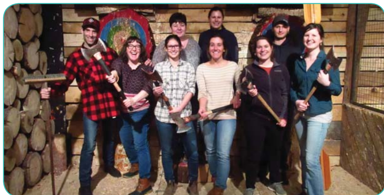
Coastal Action staff channeling their inner lumberjack on March 31 for Staff Day at the Timber Lounge, "Halifax".

Bluenose Coastal Action Foundation , established in December 1993, is a charitable organization that addresses environmental concerns along the South Shore region of Nova Scotia. Our goal at Coastal Action is to promote the restoration, enhancement, and conservation of our ecosystem through research, education, and action. Our vision is a healthy environment supporting thriving South Shore communities.