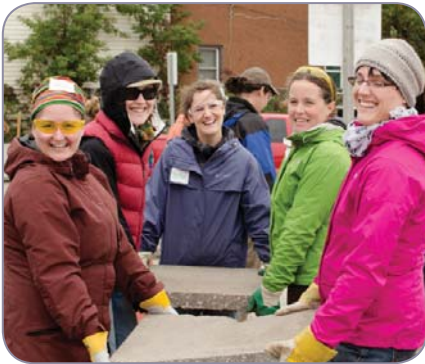
Volunteers remove broken segments of unused pavement in Ontario.