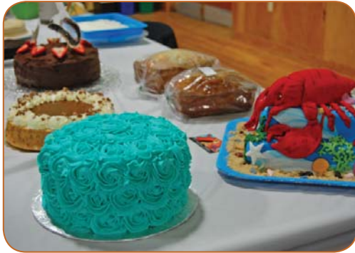
Our delicious cake auction selection from 2016.

Coastal Action prides itself on local support and community connections, and our Annual Rum and Chowder fundraiser is a wonderful example of all things local. Join us on June 9, 2017 (6-9 pm) at the Lunenburg School of the Arts to taste our delicious array of local chowders. Last year we had 14 Lunenburg County restaurants donate chowder to our fundraising event. How many can you sample, you may ask? All of them!