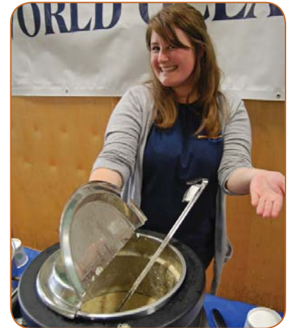
Help yourself to delicious chowders!

Terra Beata, a maritime cranberry farm nestled next to the Atlantic Ocean near Lunenburg, Nova Scotia, bring their produce to the event, as well. While cranberries are their specialty, Terra Beata uses the best fruit Nova Scotia has to offer in their 10 gourmet preserves, their unique low-sugar flavour-