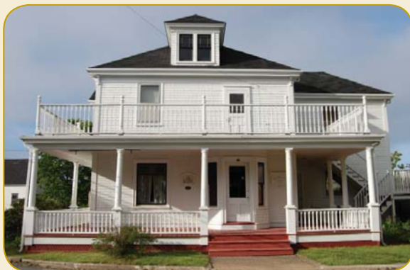
Our home: Captain Angus Walters House in Lunenburg.

If you'd like to read further, in-depth information regarding the stories highlighted in this issue, please visit our website ( www.coastalaction.org ) where we post more detailed updates on all of our projects. We have lots on the go here at Coastal Action: research, education and outreach, public engagement activities, and volunteer opportunities. If you'd like to see a report on one of our projects or events in the Coastal Chronicle , send us an email at editor@coastalaction.org .