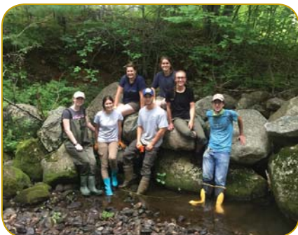
Our 2016 Watershed crew take a break from stream restoration work.

April showers give way to May flowers - and that also means the return of Coastal Action's seasonal staff! Summer is when we collect most of our scientific data and complete habitat restoration work, and we're very happy to welcome a great team to help with our busiest time of year. As of April 24, Coastal Action will have a compliment of six full-time,